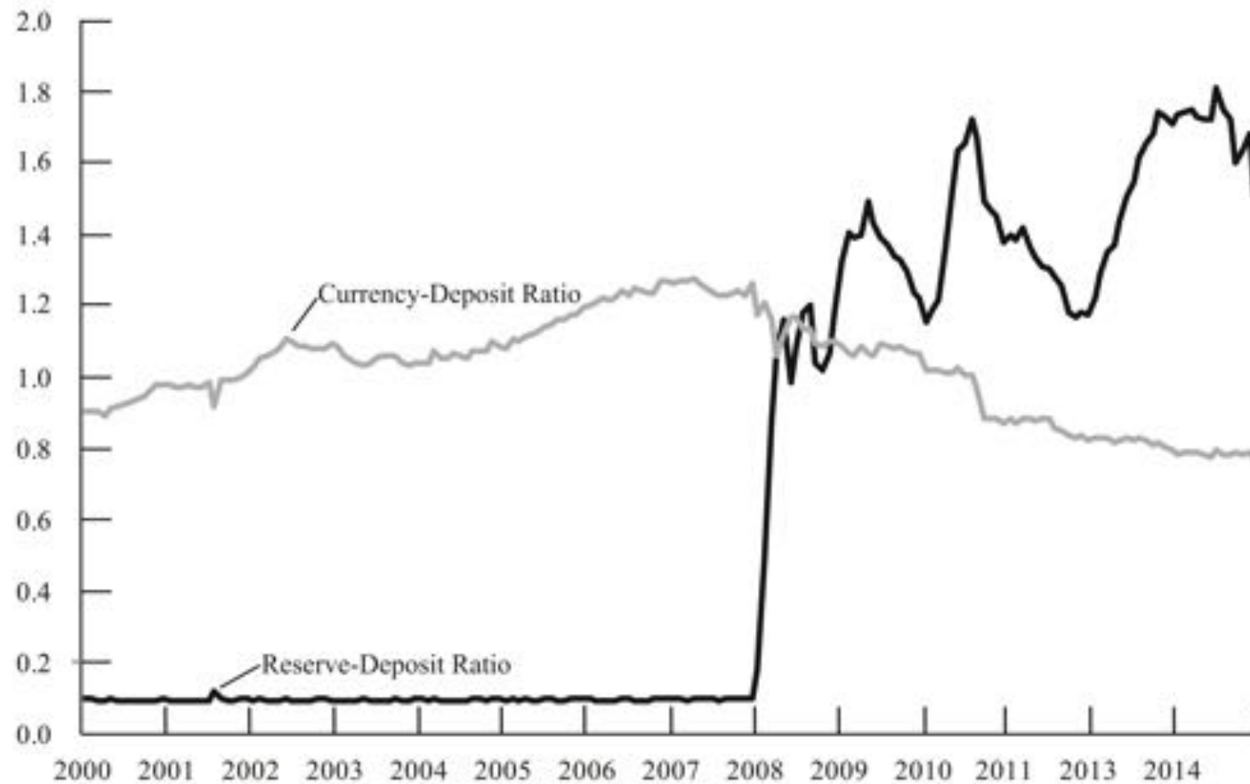
Figure 1 Reserve-Deposit Ratio and Currency-Deposit Ratio

Note: Reserves are for all depository institutions, currency is currency in circulation, and deposits are those associated with the money supply measure, M1 .