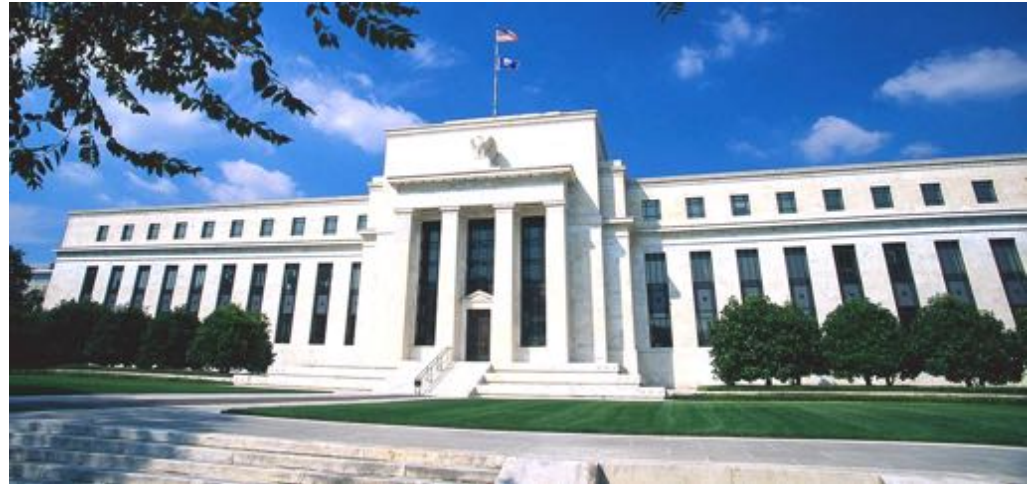
The Federal Reserve Building Washington, DC